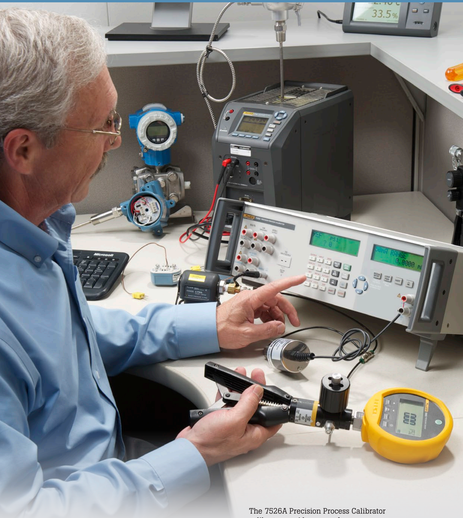
The 7526A Precision Process Calibrator calibrates a wide range of pressure gauges, temperature transmitters, digital process simulators, multimeters and more.